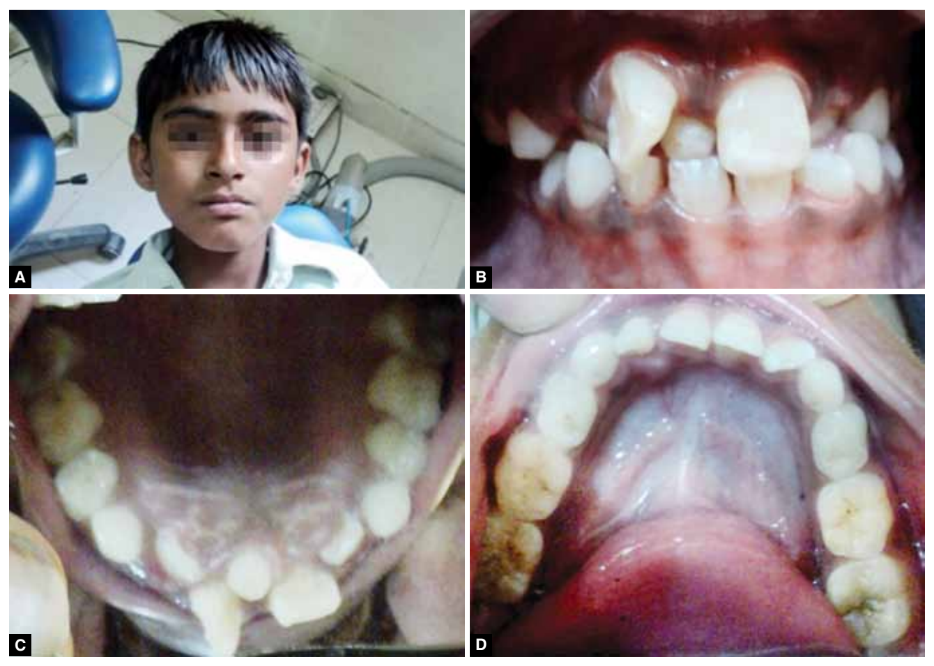
Figs 1A to D: Extraoral and intraoral examination

After extraction of the mesiodens, total space analysis revealed adequate space for the mesiodistal alignment of rotated central incisor. After 2 weeks of extraction of mesiodens, bondable buttons were placed on the labial and palatal surfaces of upper right central incisor (Fig. 2A). Fabrication of removable appliance, made of an acrylic base plate with modified Adam's clasp with distal extension in relation to upper left central incisor and a loop for engaging elastics (Fig. 2B), was fabricated near the deciduous upper right canine. Elastics were placed between palatal bondable button and the distal extension of adams clasp, and also between the labial bondable button and the loop (Figs 2C and D). After 4 months of follow-up, bondable buttons were removed (Figs 2E and F); and pericision/circumferential supracrestal fibrotomy was performed (Fig. 3A). For overcorrection of the rotated tooth, a Hawley's appliance was fabricated with a z-spring on upper right lateral incisor with posterior bite plane for correction of cross bite (Figs 3B to D). At the end of the treatment, fixed palatal retainer was placed to prevent relapse (Figs 3E and F).