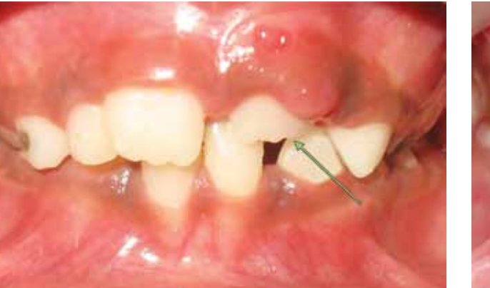
Fig. 1B: Self-correction of ectopically erupted 21 after extraction of retained 61 (Case 1A)