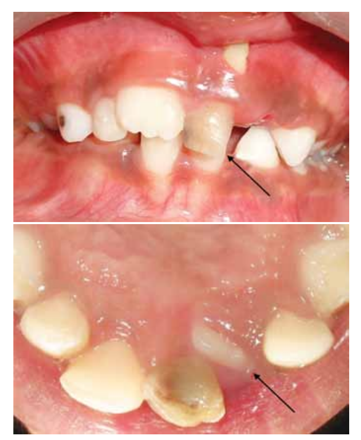
Fig. 1A: Intraoral frontal and occlusal view showing presence of retained 61 and ectopically erupting 21 (Case 1A)

Children aged 8 (Case 1A) (Fig. 1A) and 7.5 years (Case 1B) (Fig. 2A) were reported to our department with the chief complaint of abnormally erupting tooth in the upper