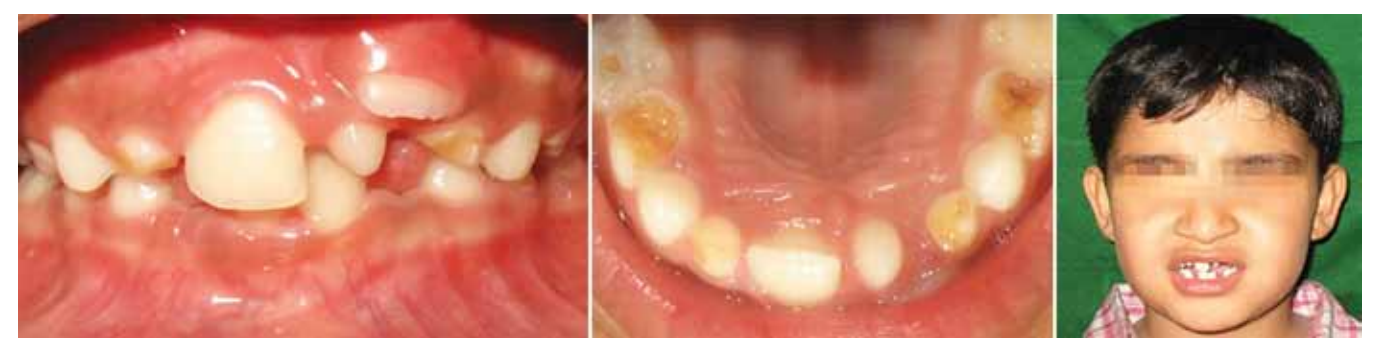
Fig. 4A: Pretreatment view showing ectopically positioned 21 and erupted mesiodens (Case 3)

Intraoral examination revealed ectopically, erupting 21, which was erupting high in the labial sulcus (Fig. 5A). Both the upper-central incisors were bonded with begg brackets and both upper first permanent molars were