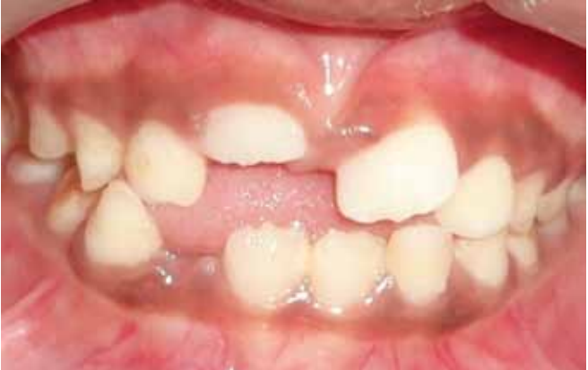
Fig. 2B: Self-correction of ectopically erupted 21 after extraction of retained 61 (Case 1B)