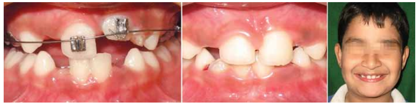
Fig. 4B: Correction of the ectopically positioned tooth by 2 × 2 Beggs appliance (Case 3)