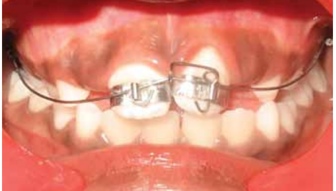
Fig. 3D: Correction of ectopically positioned 21 with uprighting spring in 2 \times 2 appliance (Case 2)