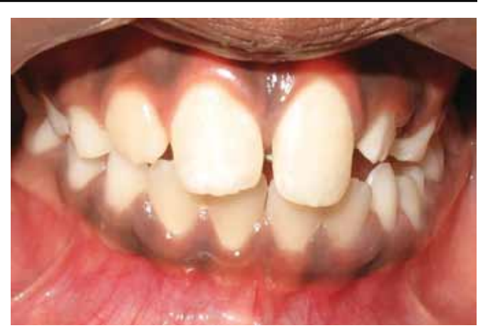
Fig. 3F: Intraoral view after 18 months post-treatment (Case 2)

The supernumerary tooth was removed and a course of 2 \times 2 appliance therapy was planned. Both the central incisors were bonded with begg brackets and both the upper second deciduous molars were banded and a 0.016 nickel titanium archwire was placed (Fig. 4B). The arch