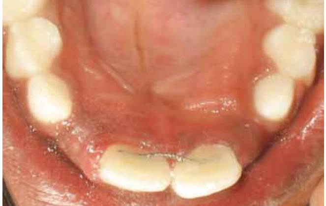
Fig. 3E: Frontal and occlusal view after alignment (Case 2)

The supernumerary tooth was removed and a course of 2 \times 2 appliance therapy was planned. Both the central incisors were bonded with begg brackets and both the upper second deciduous molars were banded and a 0.016 nickel titanium archwire was placed (Fig. 4B). The arch