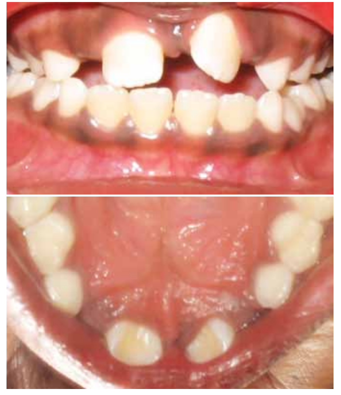
Fig. 3B: Labial and occlusal view showing persistence of ectopically positioned 21 after 2 months of extraction of mesiodens and large midline spacing (Case 2)