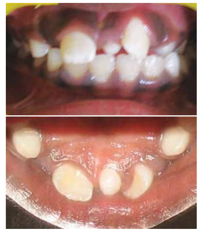
Fig. 3A: Labial and occlusal view showing ectopically positioned 21 due to presence of the erupted mesiodens (Case 2)

A healthy 7-year-old boy was brought by his mother to the department of pediatric dentistry with the complaint of small conical tooth in upper front region. The patient had no significant medical and dental history and intraoral examination revealed an erupted mesiodens and ectopically erupting 21 (Fig. 4A).