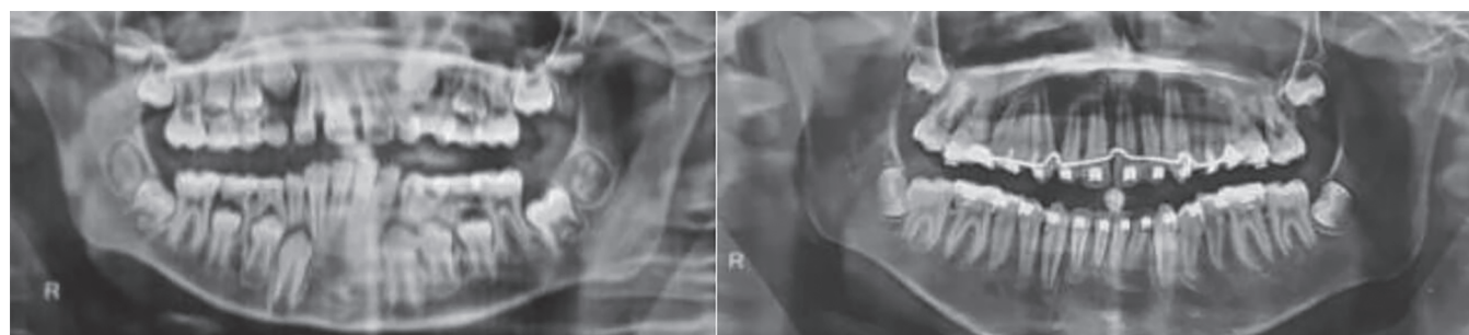
Fig. 4: Pretreatment and posttreatment OPG