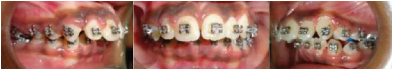
Fig. 6: Intraoral photographs after alignment and leveling