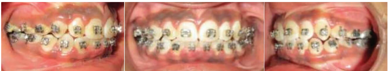
Fig. 8: Intraoral photographs after mandibular advancement and PowerScope removal