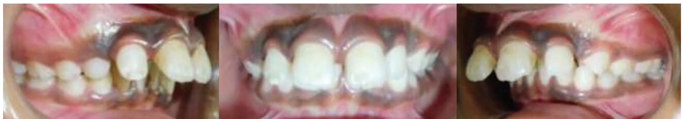
Fig. 2: Pretreatment intraoral photographs