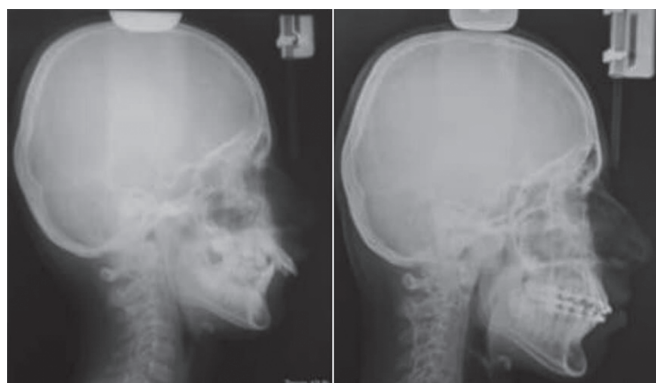
Fig. 3: Pretreatment and posttreatment lateral cephalogram

correction of skeletal class II malocclusion, to correct dental midline, to attain class I molar relation and class I canine relation on both sides, achieve proper inclination of upper and lower anteriors with normal overjet and overbite and an esthetically pleasing soft tissue profile without extracting teeth.