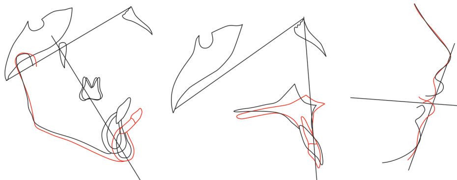
Fig. 9: Hard tissue and soft tissue superimposition