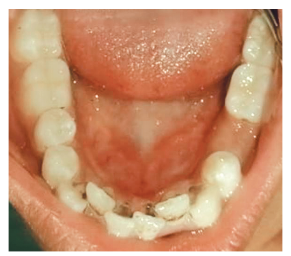
Fig. 1: Clinically missing mandibular second premolar