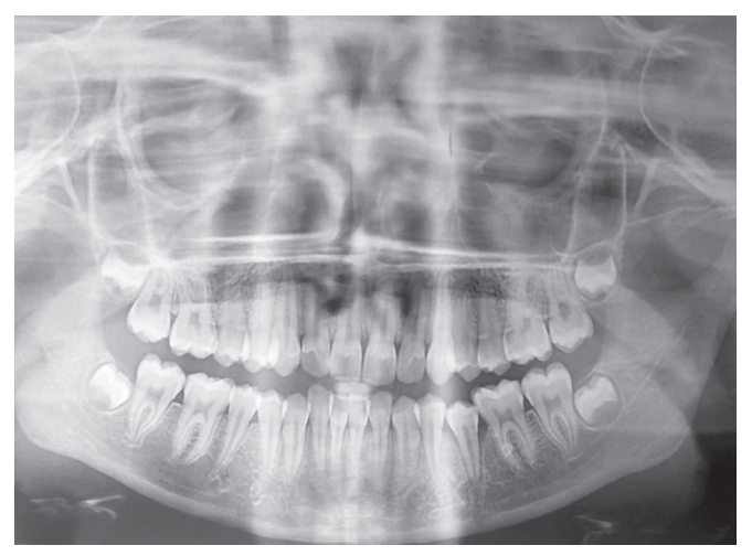
Fig. 14: OPG after 6 months

The incidence of odontomes is common in permanent dentition than primary teeth. <sup>5</sup> The patient in our case is a 13-year-old girl, agreeing with the majority of reported cases, where tumors were seen more frequently in the first two decades of life. <sup>5,11,12</sup> The compound odontome is most habitually seen in the incisor and canine region of the upper jaw as and when compared to complex odontome which is commonly observed in the first and the second molar region of the lower jaw. Both types of odontomes occurred most frequently on the right side of the jaw than the left. <sup>13,14</sup> However, our case was reported on the left side of the jaw with both