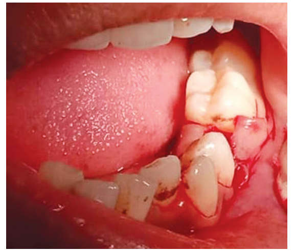
Fig. 6: Raising of mucoperiosteal flap

was reflected (Fig. 6). A window was made at the surgical site with bone-cutting burs and the rudimentary denticles were exposed (Fig. 7). The tooth-like structures were removed without causing