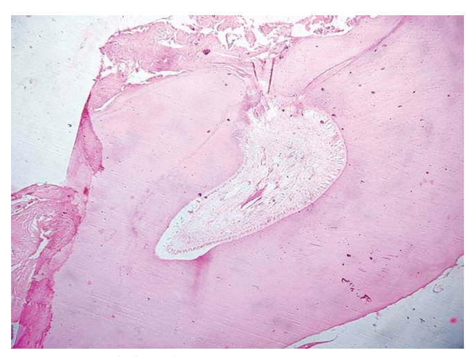
Fig. 10: Histopathological I