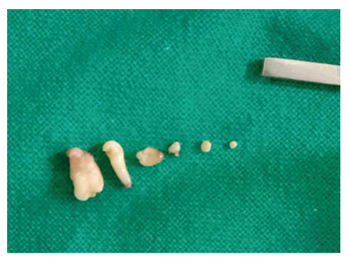
Fig. 8: Retrieved tooth-like structures

any harm to the underlying teeth and the removed assemblies were sent for histopathological examination (Fig. 8). Macroscopic examination revealed four miniature tooth-like structures appearing like compound odontomes and five irregular masses resembling complex odontomes. One odontome was intentionally left due to its proximity to the mesial root of 36 (Fig. 9). The surgical flap was repositioned and sutured aptly in place. Histological examination of the decalcified section revealed two types of odontomes: (1) With enamel, dentinoenamel junction, dentin, pulp,