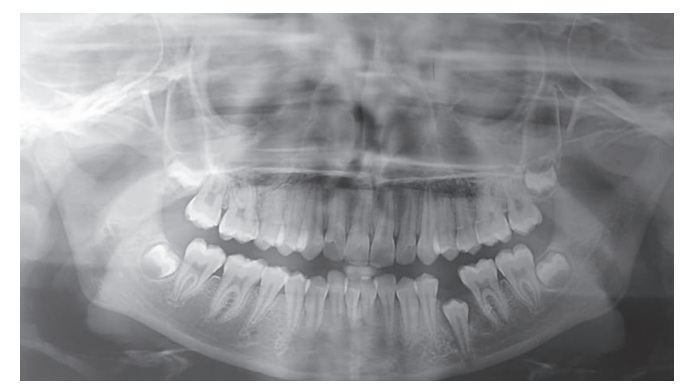
Fig. 12: OPG after 1 month

and the cementum in a way alike to normal tooth considering it as compound odontome. (2) With enamel space, pulp, and cementum considering it as complex odontome (Figs 10 and 11).