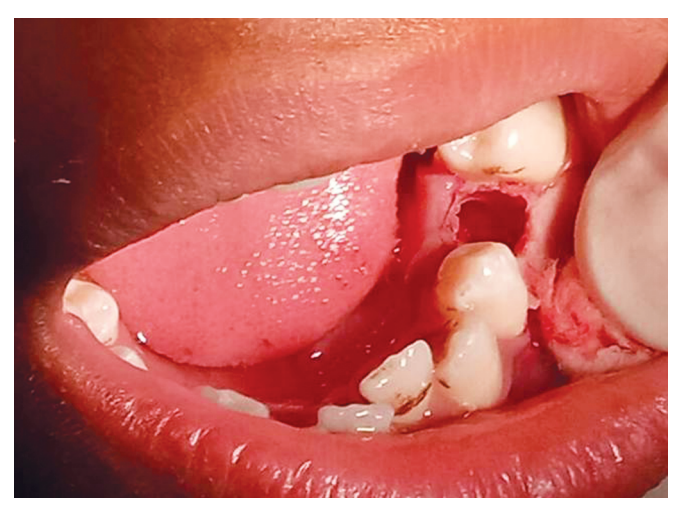
Fig. 7: Preparation of surgical window