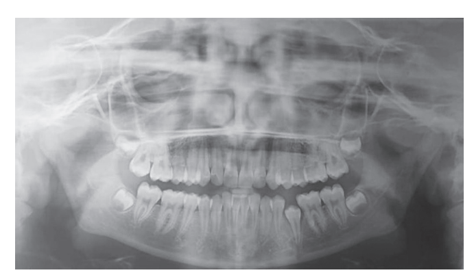
Fig. 13: OPG after 3 months