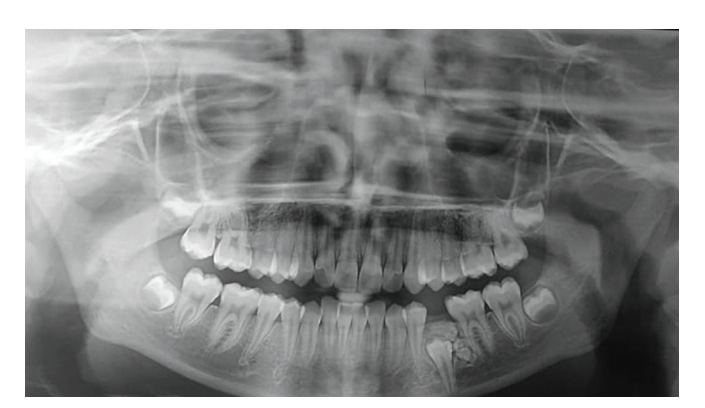
Fig. 5: Orthopantomograph

mucosa was normal, and there were no signs of redness, ulceration, pain, or swelling. On radiological inspection, a radiopaque mass was observed consisting of multiple miniatures tooth-like structures located in the superior and distal aspect of impacted 35 (left mandibular second premolar) (Figs 4 and 5). The surgical removal was planned under local anesthesia in the department of pediatric and preventive dentistry, Hazaribag College of Dental Sciences and Hospital, Hazaribagh. A mucoperiosteal flap on the buccal and lingual surfaces of the mandibular left premolar and molar teeth