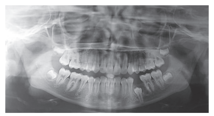
Fig. 9: One odontoma left near the mesial root of 36