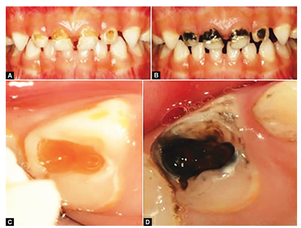
Figs 1 A to D: Pre- and postoperative photographs shown to the patients and parents before starting treatment (adopted from Alshammari et al. ^{7} )

Thirty-six children were selected for the study. Clinical examination was done regarding active carious lesions. Parents of patients were informed regarding the treatment plan and subsequent observation follow-up. Out of 36, two parents refused for the treatment; so, 34 children with 123 active carious lesions were registered in the present study. Out of these 34 children, 4 (with 17 carious lesion-14 anterior and 4 posteriors) were unsuccessful in turning up for recall visits. Thirty children (with 106 active carious lesion-71 anterior and 35 posterior) completed the study, and their parents submitted the duly filled "parent perception" evaluation pro forma.