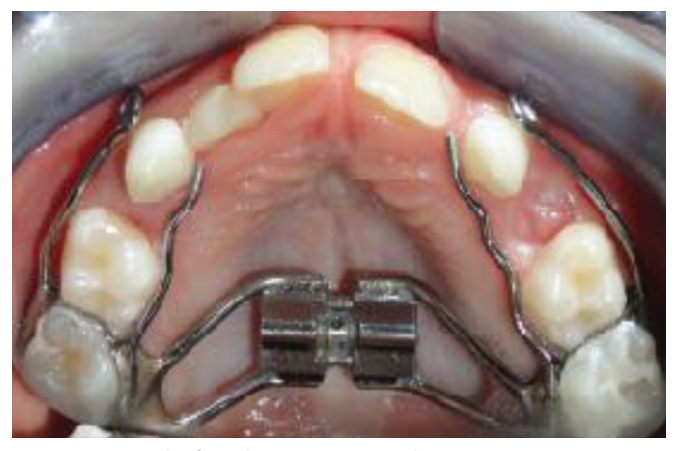
Fig. 3: Upper arch after Alt-RAMEC protocol

These data showed the efficacy of the therapy in the correction of the class III skeletal malocclusion that was reached in all patients in a period of 4–6 months of traction with the face mask.