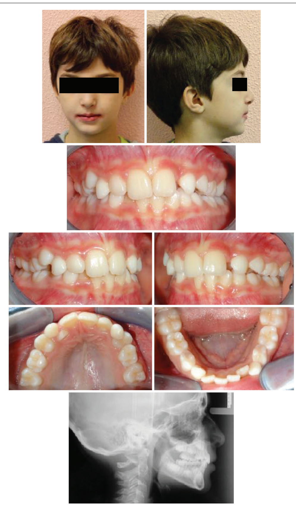
Fig. 5: Clinical case after Alt-RAMEC protocol