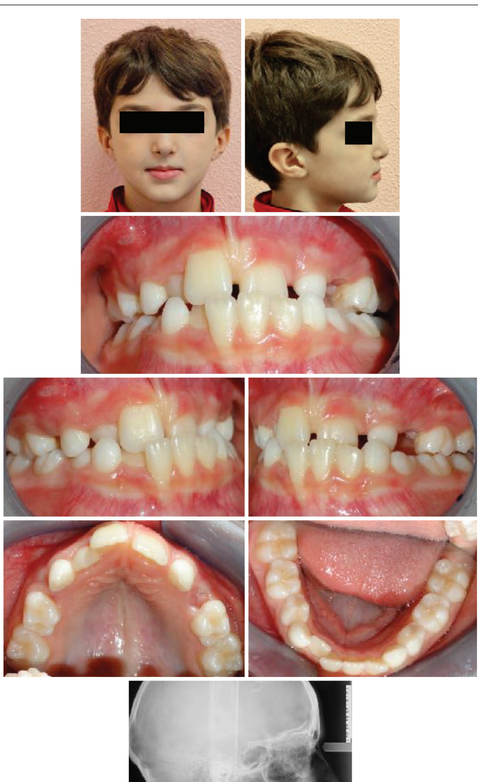
Fig. 1: Clinical case before treatment