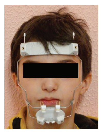
Fig. 4: Facial mask in position

Finally, dental effects were minimal: no significant changes were reported at the incisor position in relation to the bispinal plane and