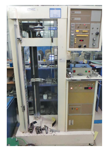
Fig. 2: Instron universal testing machine

universal testing machine so that the load will be applied to the diameter of the specimens. When the maximum load was applied to the fracture, the specimens were recorded at a crosshead speed of 0.1 mm/minute and the DTS was calculated using the following formula: T = 2P/\pi DL , where P is the maximum applied load (N), D is the measured diameter of the sample (mm), and L is the measured length of the sample (mm).