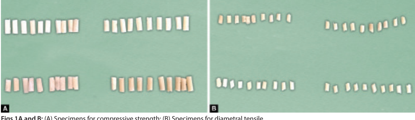
Figs 1A and B: (A) Specimens for compressive strength; (B) Specimens for diametral tensile