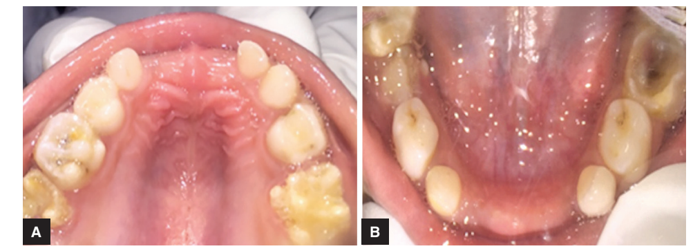
Figs 2A and B: (A) Clinically missing 51, 52, 61, 65. Hypoplastic 16,26; (B) Clinically missing 71, 72, 81, 82. Grossly decayed 75