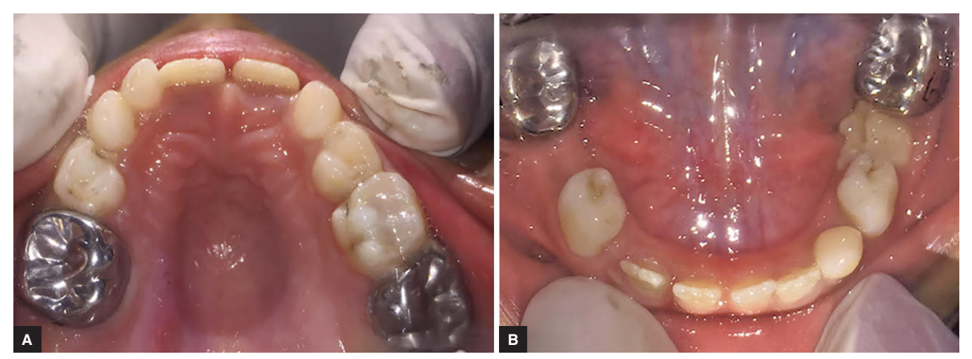
Figs 4A and B: Postoperative photographs showing restorations and stainless steel crowns in upper (A) and lower (B) arches

Another critical factor is the loss of vertical dimensions, if multiple posterior primary teeth need to be extracted. Thus, there is a delicate balance between the benefits and possible risks of using stainless steel crowns.