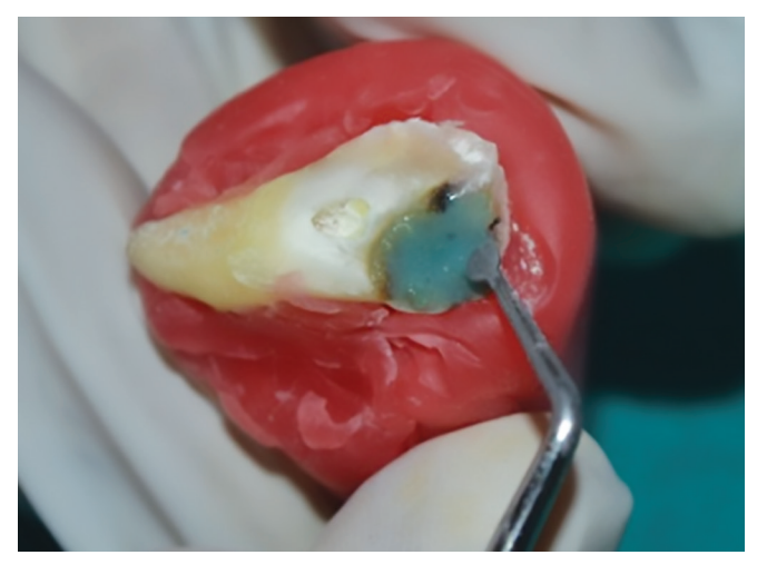
Fig. 2: Excavating the caries after placing chemomechanical caries removal agent using a spoon excavator