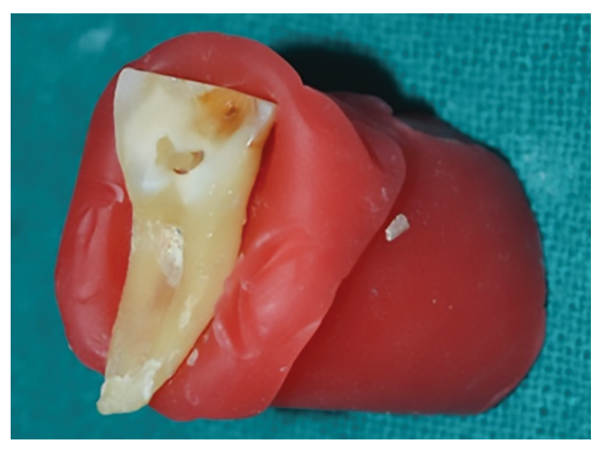
Fig. 3: Caries-affected dentin left after caries excavation

were then stored in water at 37°C for 24 hours. The teeth were then individually fixed to a sectioning block using acrylic resin. Using hard tissue microtome 1 mm thick sections containing bonded caries-affected dentin specimens were obtained from each tooth depending on the size of caries lesion. The slices were then trimmed and shaped to form a gentle curve along the adhesive interface from both sides using superfine diamond burs to obtain a rectangular cross-sectional shape with the surface area of approximately 1 mm<sup>2</sup>. The beams were then attached to a custom-made jig and were attached to the Instron universal testing machine. A tensile load was applied at a cross-head speed of 0.5 mm/min until the beam fractured, and the load at which the fracture occurred was recorded.