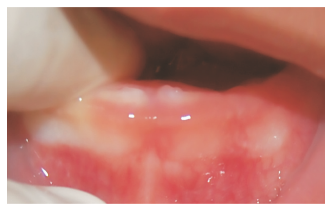
Fig. 4: Four months follow-up, showing normal eruption of the deciduous central incisors

injury. Regardless of this initial decision, the possibility of surgical intervention was not discarded if there was no spontaneous regression.