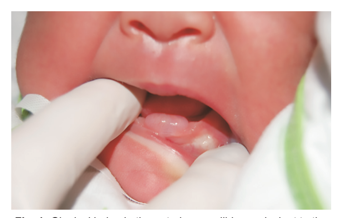
Fig. 1: Gingival bulge in the anterior mandible, equivalent to the presence of central incisors

Physical examination revealed an exophytic lesion 2 cm in diameter, compressible, flaccid, and yellow, leading to an initial diagnosis of "congenital EC." The newborn exhibited no feeding problems or other complications. A radiograph of the mandibular anterior occlusal revealed the superficial placement of the deciduous central incisors (Fig. 2). The procedure of choice, based on the patient's age and the clinical diagnosis, was monitoring of the