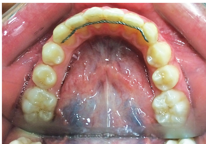
Fig. 1: Loss of attachment with no dislocation