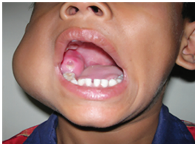
Fig. 1: Bony hard, non-tender swelling inside the oral cavity, distal to the deciduous second molar

A 5-year-old otherwise healthy boy presented with a slowly enlarging painless swelling on the lower right side of his face. The clinical examination revealed he had a bony hard, nontender swelling, extending from the posterior border of the mandible up to tragus of the right ear, while the overlying skin was normal in color without any secondary changes (Figs 1 and 2).