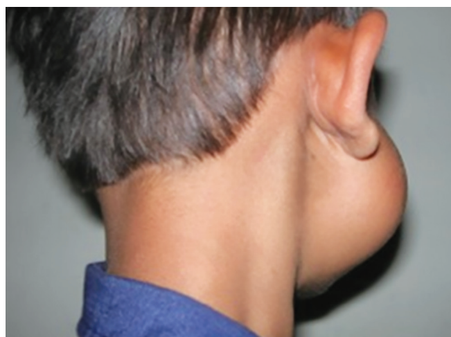
Fig. 2: Swelling, extending superoinferiorly from the posterior border of mandible up to tragus of the right ear

1,2 Professor and Head, 3 Reader, 4 Postgraduate Student