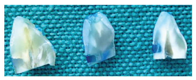
Fig. 2: Buccolingual section of the specimens

Comparative Evaluation of Bond Strength and Microleakage of Standard and Expired Composite at Resin-Dentin Interface