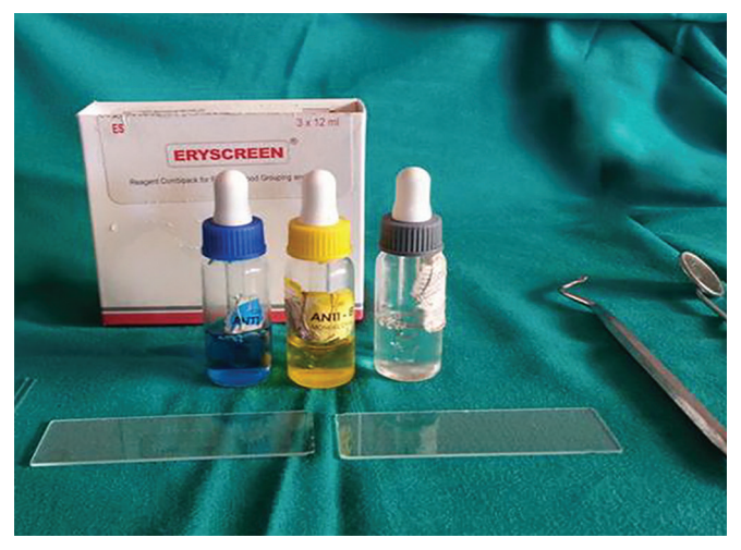
Fig. 1: ABO blood grouping by slide agglutination method

Blood Group Determination using DNA extracted from Exfoliated Primary Teeth at Various Time Durations and Temperatures