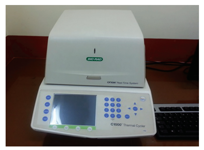
Fig. 6: BioRad

using a barbed broach, which was then placed in vials with sterile normal saline and preserved at 4°C till DNA extraction was carried out (Fig. 4).