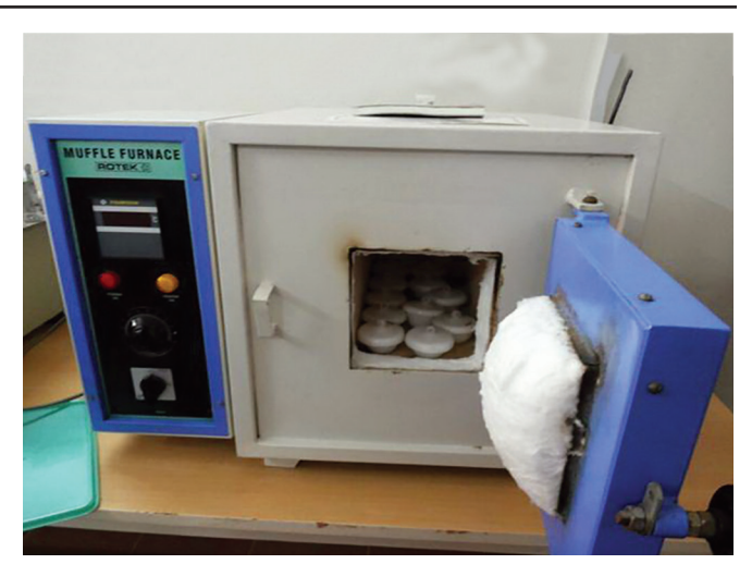
Fig. 2: Heating of samples in muffle furnace

partially degraded DNA as well and is fast, sensitive, and one of the most reliable analyses in the forensic field.<sup>9</sup>