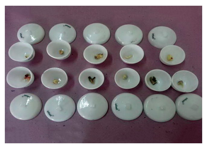
Fig. 3: Heated samples

Access opening was done on the collected teeth samples, and dental pulp tissue was collected from each sample