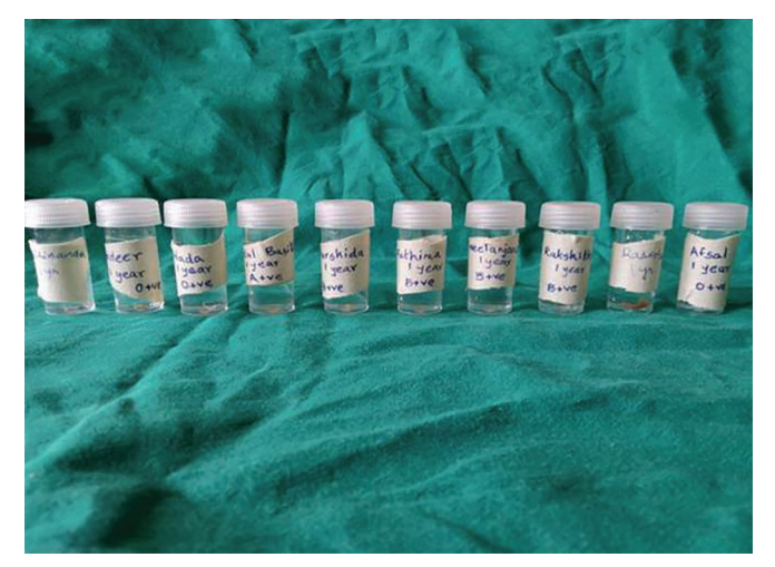
Fig. 4: Pulp tissue stored in saline