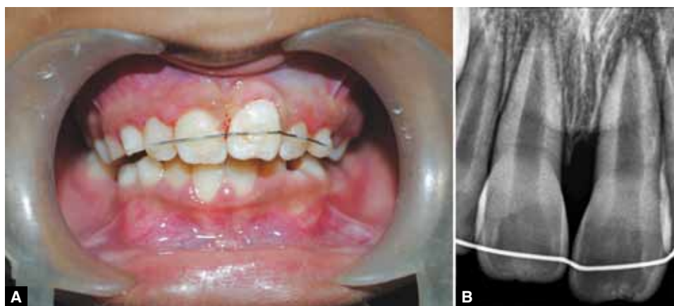
Figs 2A and B: Immediate postoperative clinical picture and intraoral periapical digital radiograph showing splint

Radiograph taken at 3 months post-derotation revealed deposition of bone with well defined lamina-dura in the apical 3rd of the developing root. An appreciable amount of root end closure with increase in root length was also observed. There was no noticeable difference in the radiographic findings between 3 and 6 months radiographs. At 12 months, pulp space in both 11 and 21 appeared to have reduced in size, indicating deposition of secondary dentin along the pulpal wall. The physiologic root growth of 21 was delayed as compared to 11. At the end of 18 months, 21 revealed radiographic root end closure.