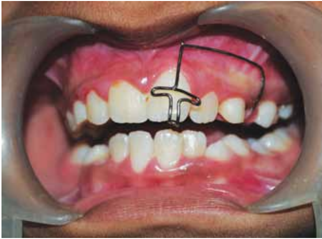
Fig. 3: Orthodontic removable appliance (modified self supporting spring)