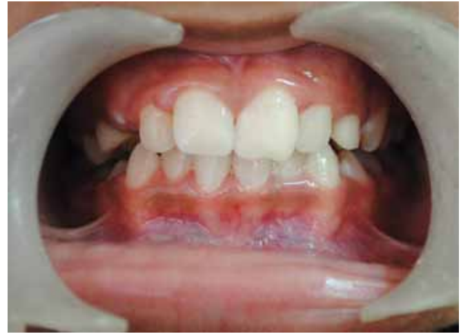
Fig. 4: Clinical picture at 6 months follow-up