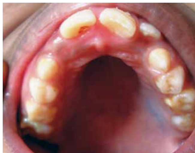
Fig. 2: Intraoral examination

1 Professor and Head, 2,3 Senior Lecturer