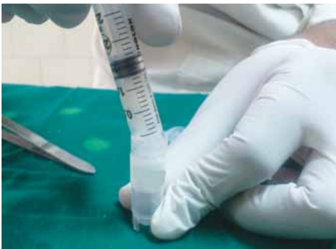
Fig. 3: Cotton pledget placed in syringe and saliva expressed in sterile container

A detailed medical history was taken to rule out any systemic disorder in all the children. Saliva was collected from all children between 10.00 am and 12.00 pm to avoid circadian variation. Children of group 1 were uninformed about the study before saliva sample collection as it may have induced fear in them which can affect sAA levels. In