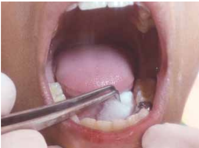
Fig. 2: Cotton pledget placed below the tongue