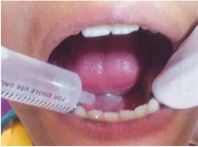
Fig. 1: Oral cavity rinsed with deionized water