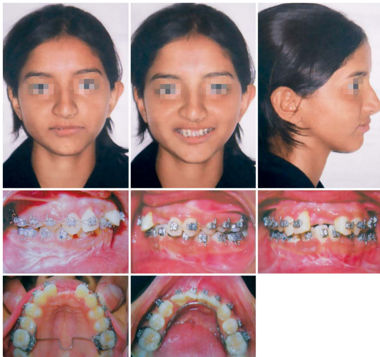
Fig. 3: Both the arches were aligned and leveled with fixed mechanotherapy