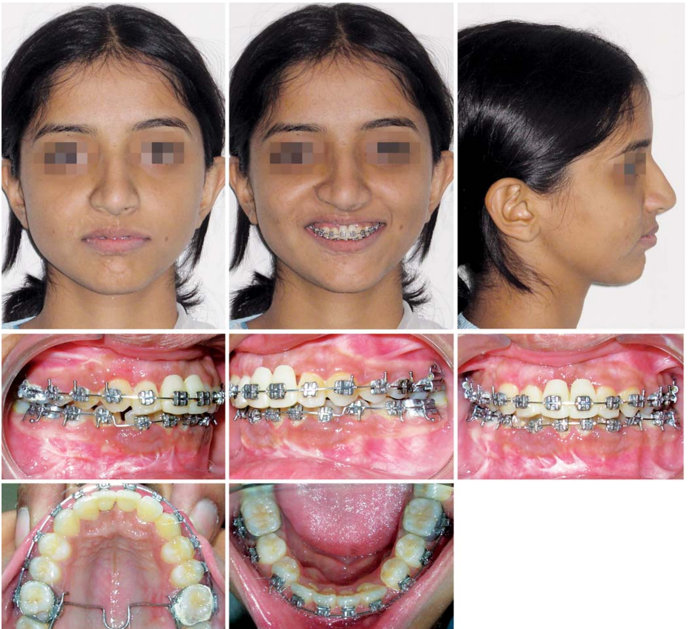
Fig. 6: Extraoral and intraoral views with riding pontics in the place