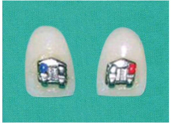
Fig. 5: Riding pontics with bracket in place

for maintaining/opening the space, good esthetics during orthodontic treatment can be a concern. 1 Riding pontics 2 are a better alternative than bonding an acrylic tooth to adjacent teeth.