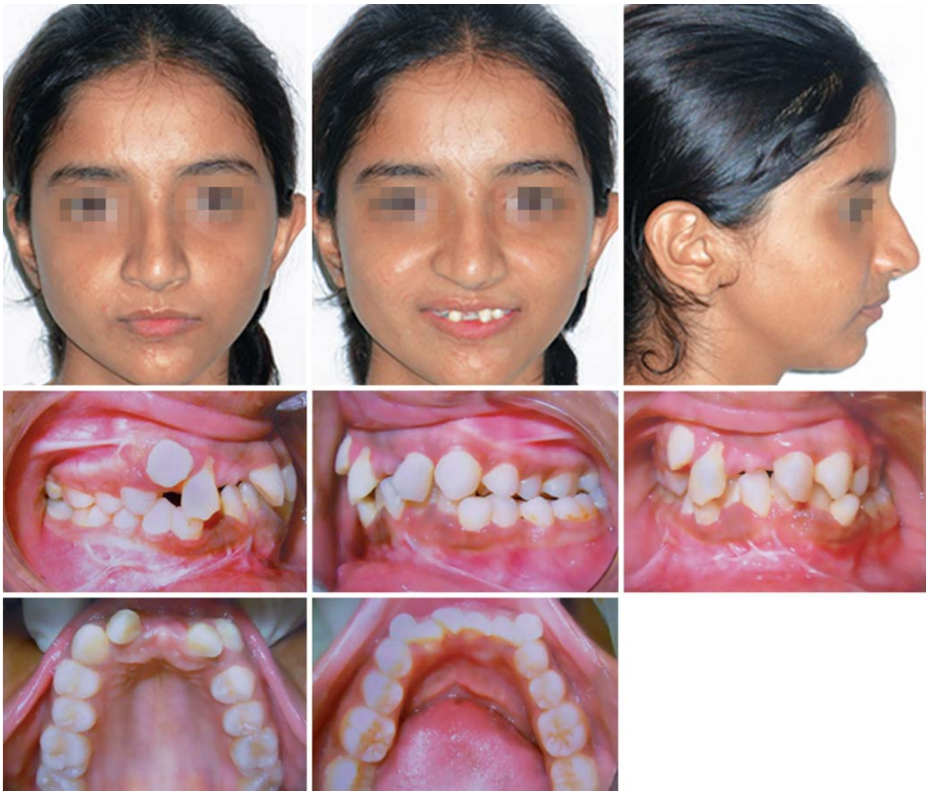
Fig. 1: Extraoral and intraoral views

Dentists often encounter patients with congenitally missing or malformed teeth. Treatment options include either orthodontic space maintenance/opening for future restoration or orthodontic space closure. When this situation occurs in the anterior region and the treatment plan calls