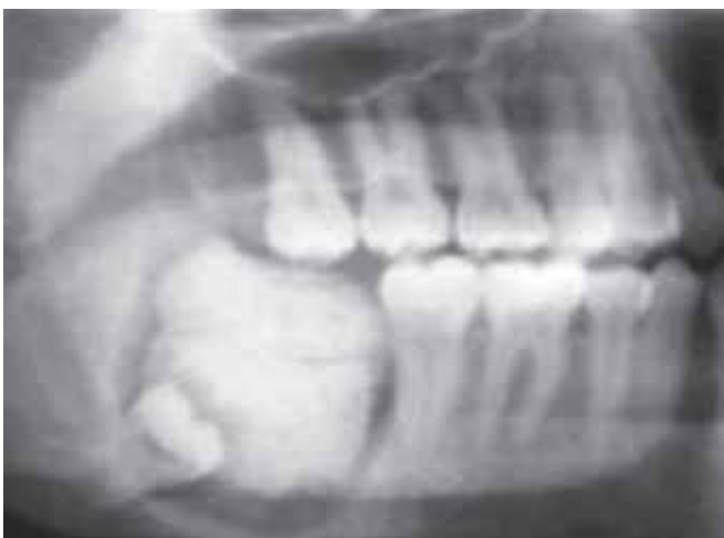
Fig. 3: Radiograph of complex odontome