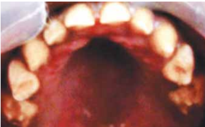
Fig. 2: Preoperative maxillary occlusal view

The patient was informed for the diagnosis, and all the treatment modalities of full mouth rehabilitation were explained to patient and the parent. The patient was placed on intensive oral hygiene program, including scaling, and after 2 weeks the level of oral hygiene maintained by the patient was acceptable with improvement in soft tissues.