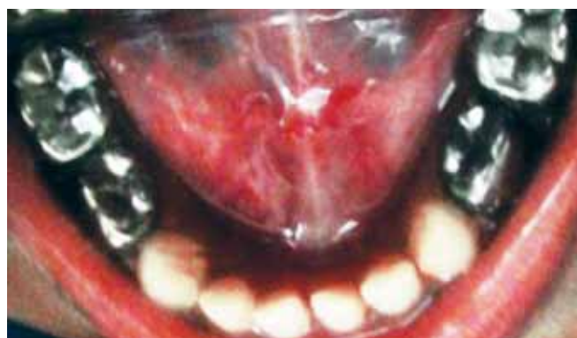
Fig. 10: Postoperative mandibular occlusal view