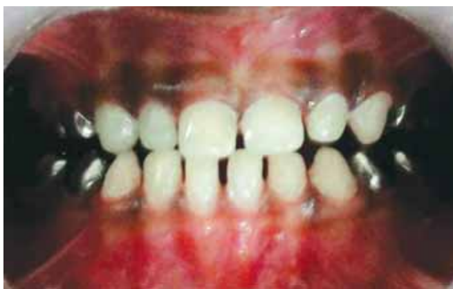
Fig. 11: Postoperative occlusal view

hypersensitivity disappeared completely and functional chewing was established. The patient was recalled 6 and 12 months after the treatment, wherein psychology of patient was found to have improved greatly due to esthetic rehabilitation (Fig. 12).