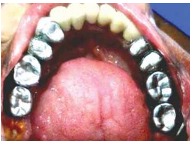
Fig. 7: Mandibular occlusal view of mother's dentition with prosthetic rehabilitation and partially erupted hypoplastic 38

All posterior molars were restored with 3M S.S crowns and indirect veneers were fabricated for maxillary and mandibular anteriors due to uncooperative nature of the young pediatric patient.