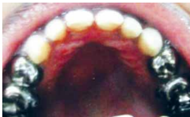
Fig. 9: Postoperative maxillary occlusal view

were acid-etched for 30 seconds with 37% H_3PO_4 (Total etch, Vivadent) thoroughly washed and dried with cotton pellets. Single bond adhesive system (3M/ESPE) was applied for 20 seconds on the enamel and dentin and light cured for 10 seconds. The composite resin veneers were then covered with flowable composite and positioned onto teeth. The excess composite being removed with a scaler, followed by gentle air stream and light cured twice as long (80 second) as recommended by the manufacturer. After placement of all restorations, the occlusion was checked and adjusted to correct vertical dimension (Figs 9 to 11). After the restorative procedure, the patients dentin