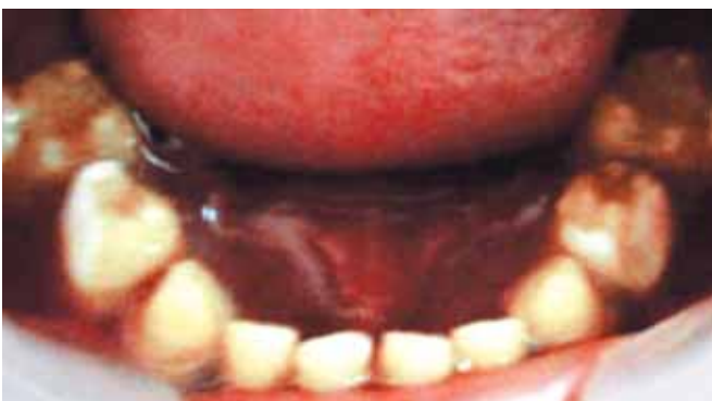
Fig. 3: Preoperative mandibular occlusal view