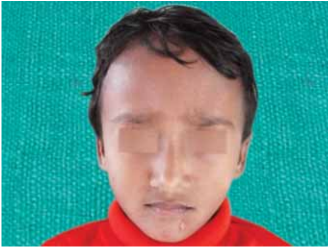
Fig. 1: Preoperative facial photograph

were performed. The patient had full deciduous dentition. The enamel layer of all teeth was very thin and yellowish brown in color and cuspal structure nearly flattened in posterior region (Figs 2 and 3). The exposed dentin was dark yellow in color and hypersensitive (Fig. 4). Periapical and panoramic radiograph revealed loss of enamel, especially on occlusal surfaces of posterior teeth and proximally (Fig. 5). The molars were in mesial step molar