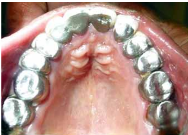
Fig. 6: Maxillary occlusal view of mother's dentition with prosthetic rehabilitation