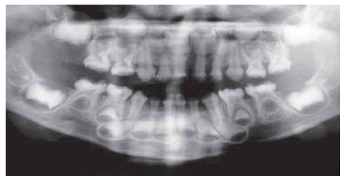
Fig. 5: OPG showing open contacts and incompletely formed enamel affecting both deciduous and underlying permanent teeth