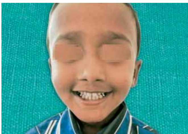
Fig. 12: Postoperative facial photograph showing patient with improved confidence

Historically, some patients with AI have been treated with multiple extractions followed by construction of complete dentures. These options are psychologically harsh, especially in adolescents. 10 Because of the advances in esthetic dentistry, especially in bonding to dentin; today it is possible to restore function and esthetics to an acceptable level and for a long time, but an extension of a direct restoration onto all surfaces of tooth crown often results in an incorrect or at least not optimal anatomic form and