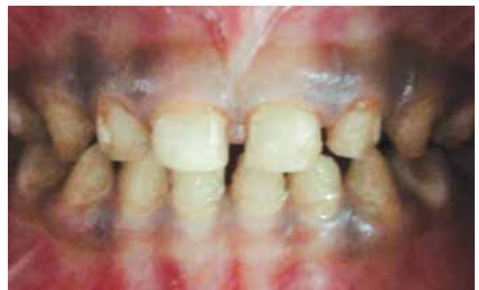
Fig. 4: Preoperative occlusal view