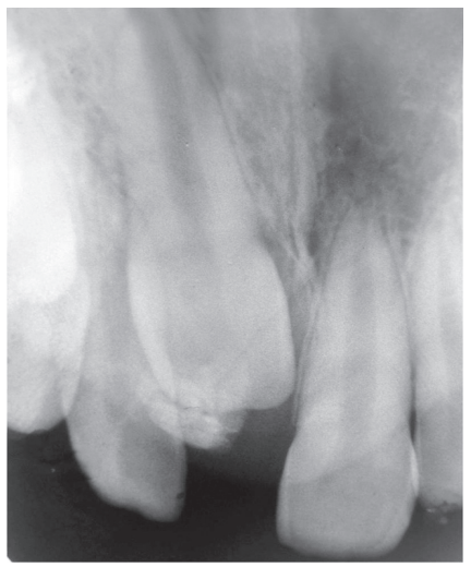
Fig. 3: Periapical radiograph showing unerupted maxillary left central incisor with fully formed roots