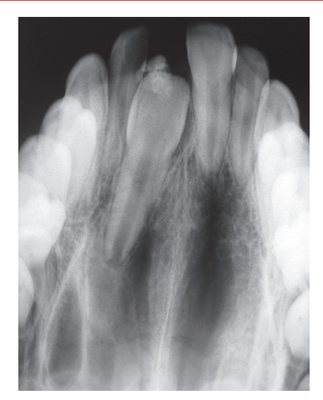
Fig. 2: Maxillary occlusal view showing calcified mass