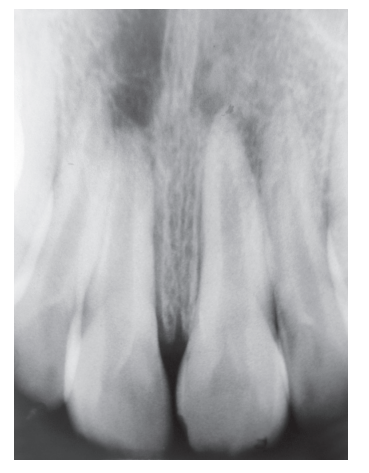
Fig. 7: Postoperative periapical radiograph after 6 months showing erupted permanent central incisor