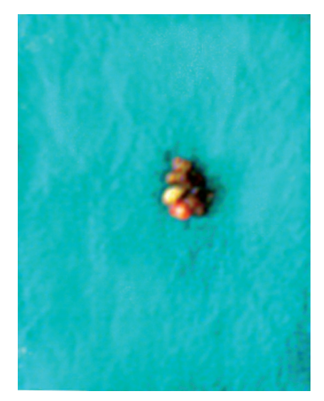
Fig. 5: Calcified mass