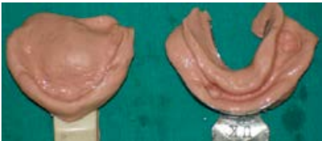
Fig. 5: Primary impression with alginate