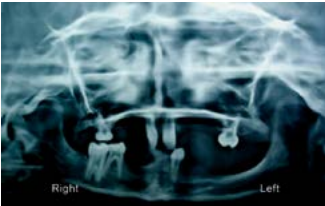
Fig. 4: Preoperative orthopantograph