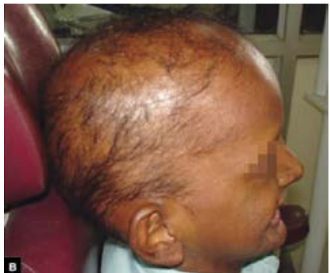
Figs 1A and B: Pretreatment photographs