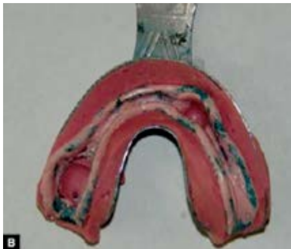
Figs 8A and B: Final impressions

support, stabilize, and retain the prosthesis. Considering the age and potential growth of our patient, it was deemed better to postpone osseointegrated implants.