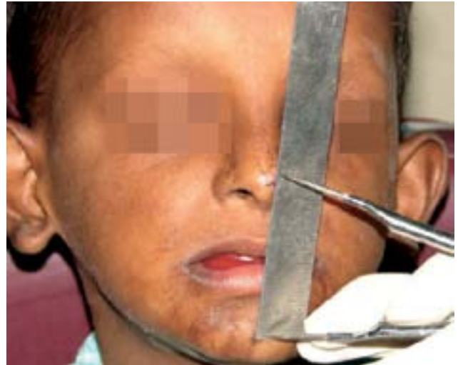
Fig. 9: Jaw relation record

In recent years, endosseous dental implants have been recognized as an important alternative for ED patients to