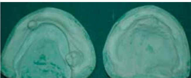
Fig. 6: Diagnostic model after extraction

The objective was to preserve the health and restore function to meet the needs of developing stomatognathic system.