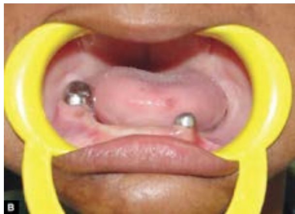
Figs 7A and B: Metal coping on mandibular teeth

Then patient did not report to the department for 2 to 3 months because he was suffering from Chickengunya. After that he had completely lost his voice and had tumbling gait due to lack of neuromuscular coordination. His oral examination revealed paralyzed right side of tongue because on protrusion tongue deviate to left side. He showed uncontrolled mandibular movements with increased salivation.