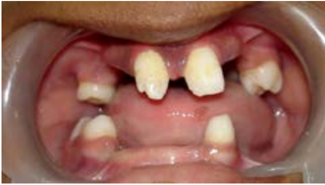
Fig. 3: Intraoral view