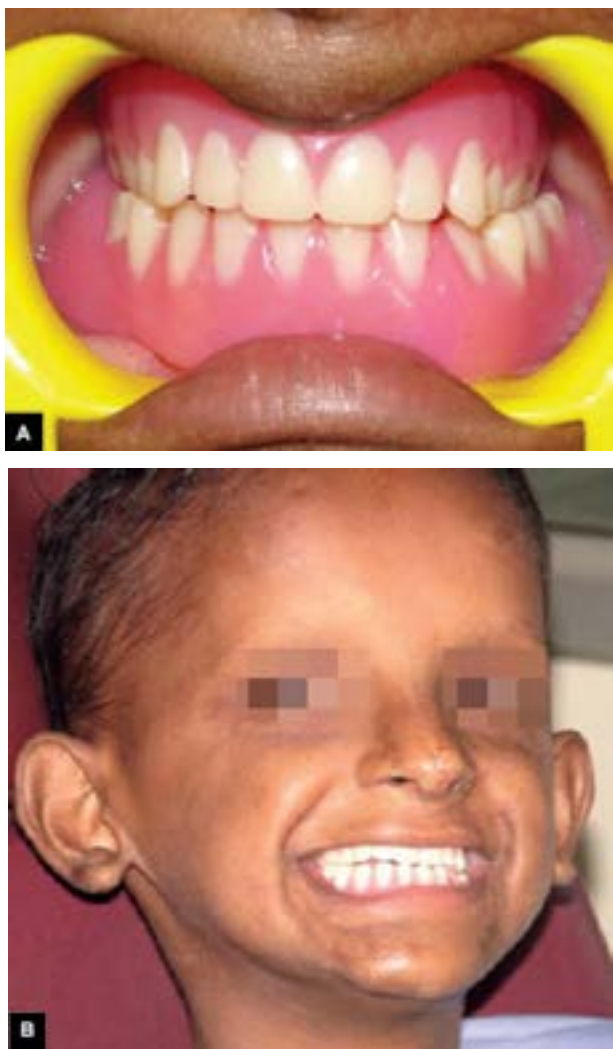
Figs 11A and B: Post-treatment photographs

The slopes of the axial walls of teeth were made nearly parallel to enhance retention and stabilization of overdenture.