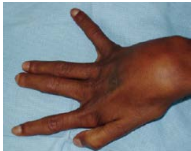
Fig. 2: Onchodysplasia