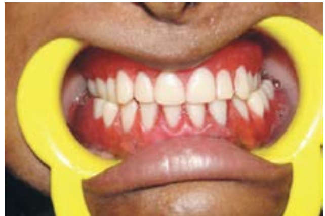
Fig. 10: Teeth arrangement, and try-in