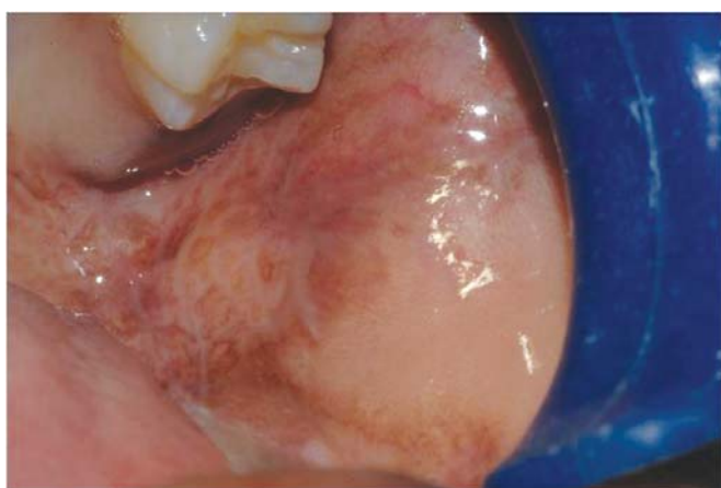
Fig. 2: Left buccal mucosa

The dental state was excellent and there were no amalgam restorations. No other mucosal or skin surfaces showed lesional changes.