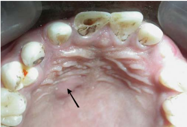
Fig. 1: Intraoral photograph showing Ellis class IV fracture of 21 and palatal swelling with pus discharge (black arrow)