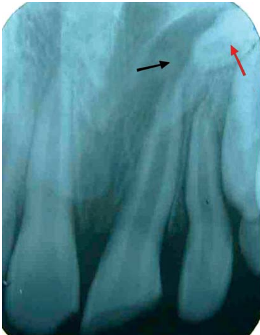
Fig. 2: Periapical radiograph showing cystic lesion in relation to 21 (black arrow) and 'mesiodens' like supernumerary tooth placed in the mid-palatal region, close to the root apex of 21 (red arrow)