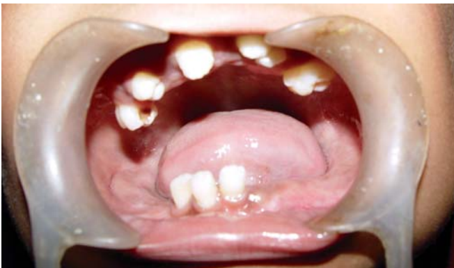
Fig. 2: Intraoral view of case showing unerupted permanent and missing deciduous teeth

Computed tomography scan of facial bones was performed on subsecond multislice spiral CT scanner. 3 mm high resolution slices were obtained in the region of