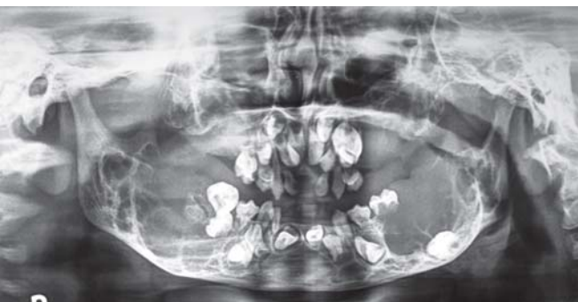
Fig. 3: Radiograph showing multiple bilateral radiolucent areas extending upto base of condyles