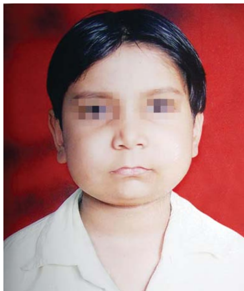
Fig. 1: Case showing bilateral swellings of face

The history revealed that the patient had been born as a full term normal delivery and showed no abnormalities until