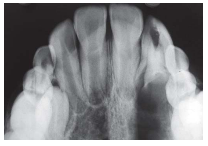
Fig. 3: Occlusal radiograph