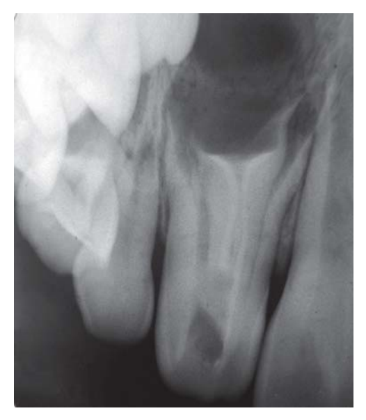
Fig. 2: IOPA showing Dens invaginatus i.r.t. upper right lateral incisor