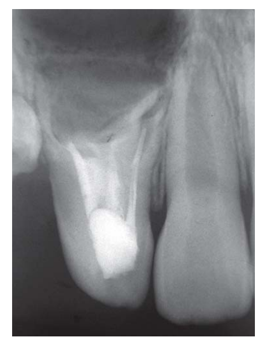
Fig. 8: Follow-up radiograph after 1 year

prophylactically with resin.<sup>12</sup> In cases in which the bacterial invasion has reached the pulp and necrosis is established, nonsurgical root canal treatment remains the treatment of choice. Depending on the type of malformation and the communication of the invagination with the pulp, the clinician may confine the endodontic therapy to the invaginated portion and, as a result, preserve pulp vitality.<sup>13,14</sup> However, in most cases, the endodontic treatment must include both the invagination and the root canals.<sup>15,16</sup> The task can become difficult, considering the anatomical variations that a dens invaginatus may present within the root canal system.