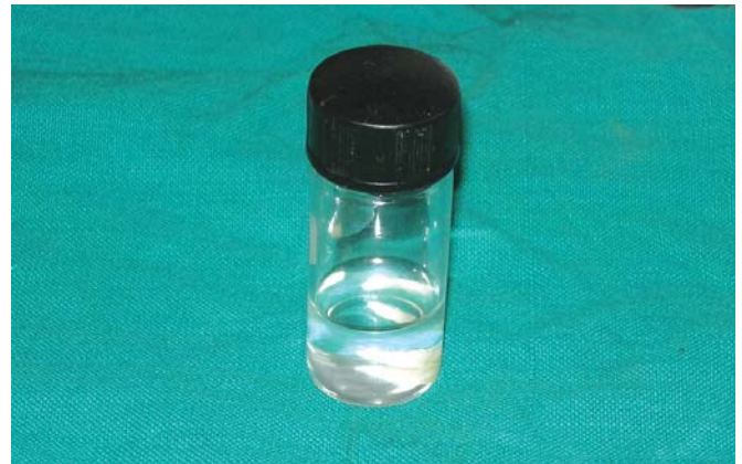
Fig. 4: Prepared and sterilized tooth stored in Hank's balanced salt solution