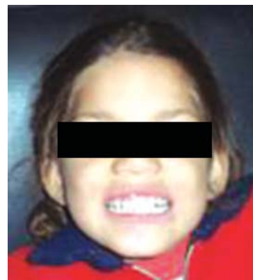
Fig. 11: Showing retentivity of biological post after 12 months

A four-year-old female child reported with pain on biting in upper anterior region and was repeatedly put on anti-inflammatory and analgesic medication since last 6 to 7 months. After completing endodontic procedures in 51, 61.