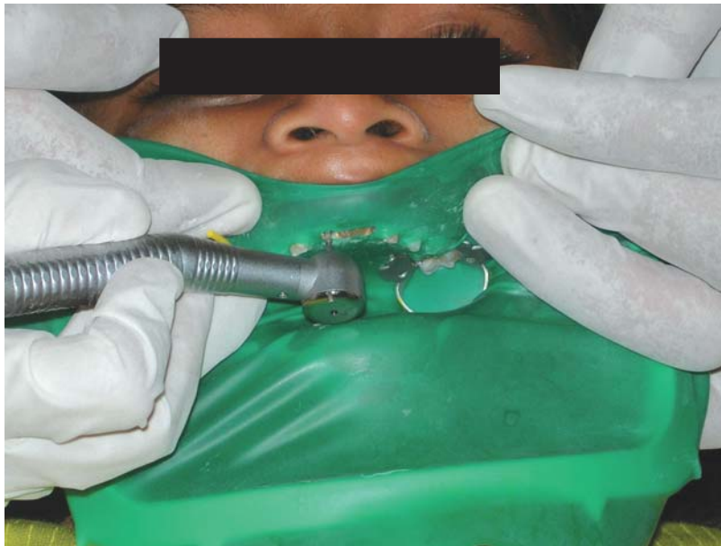
Fig. 7: Removal of endodontic filling material for preparation of core to take up the biological-post