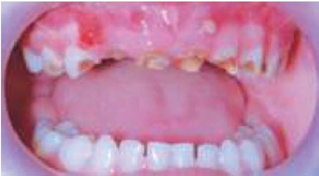
Fig. 1: Abscess formation in relation to 51,61

practices involved brushing once daily sometimes without toothpaste.