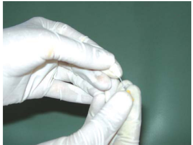
Fig. 3: Extirpation of pulpal tissue and remnants from root canal