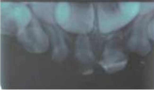
Fig. 5: Preoperative radiograph