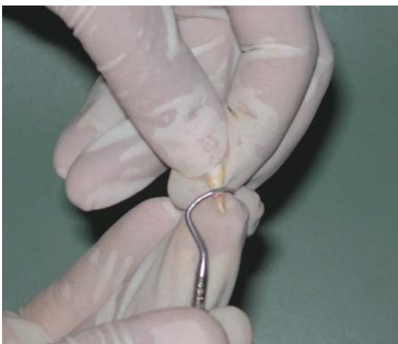
Fig. 2: Removal of soft tissue and PDL remnants from the root surface

Complete consent form records of the donor and recipient were maintained in the tooth bank records of the Department. The selected samples were procured from the Tooth Tissue Bank maintained in the Department of Pedodontics, GDC, Amritsar, where they are stored and sterilized after thorough scaling and removal of soft tissue, periodontal remnants and pulpal tissue from the root-canals and kept at 4 degree centigrade in Hank's balanced salt solution with donor identification 7-9 (Figs 2 to 4).