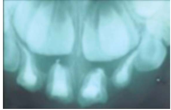
Fig. 6: Postoperative radiograph