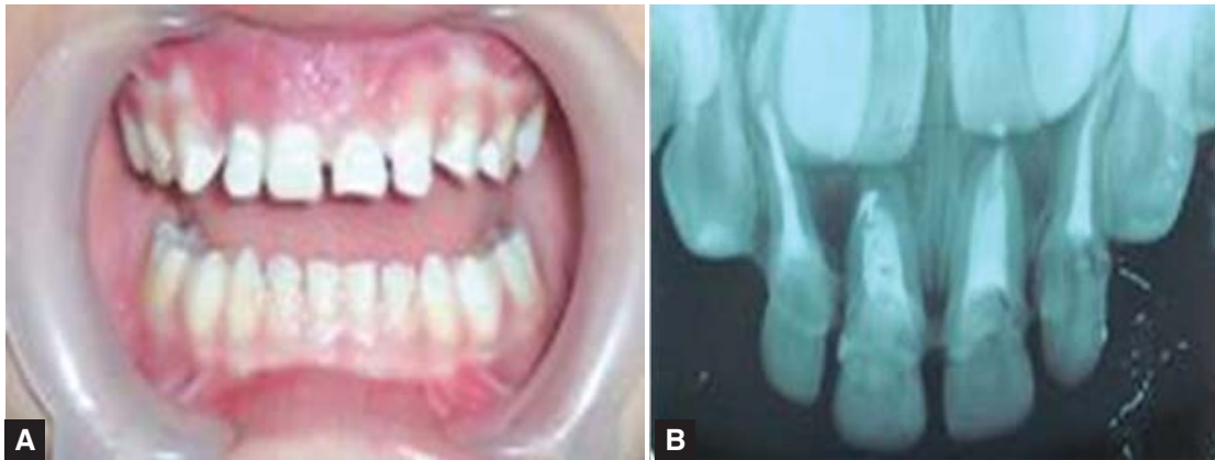
Figs 10A and B: Final esthetic result

posts. The apical third was removed and the remaining root stump filled retrograde with flowable composite material. The shaped tooth was then tried for fit in the prepared root canal and readjusted for a snug fit. The finally prepared crown and root were cemented with dual cure resin modified GIC. Excess extruded material was finished and polished to give a final esthetic result as shown in Figures 10A and B.