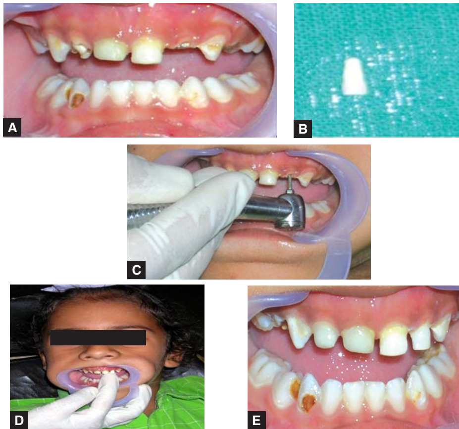
Figs 12A to E: Biological restoration given in previously lost composite buildup in 62