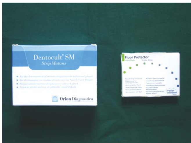
Fig. 1: Dentocult SM kit and Fluor protector